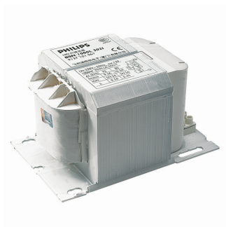
BSN 1000L 302I