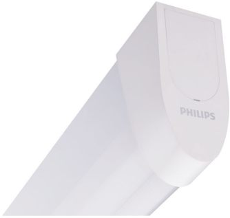
CR388C Detail Photo